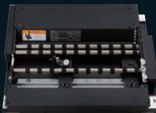
Kebab MkII L