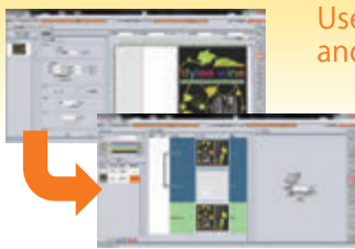
Dedicated menu for KEBAB