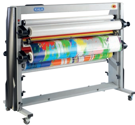
Front and rear view in a Roll to Roll configuration Included options Gas lift, LED light kit and in line slitting